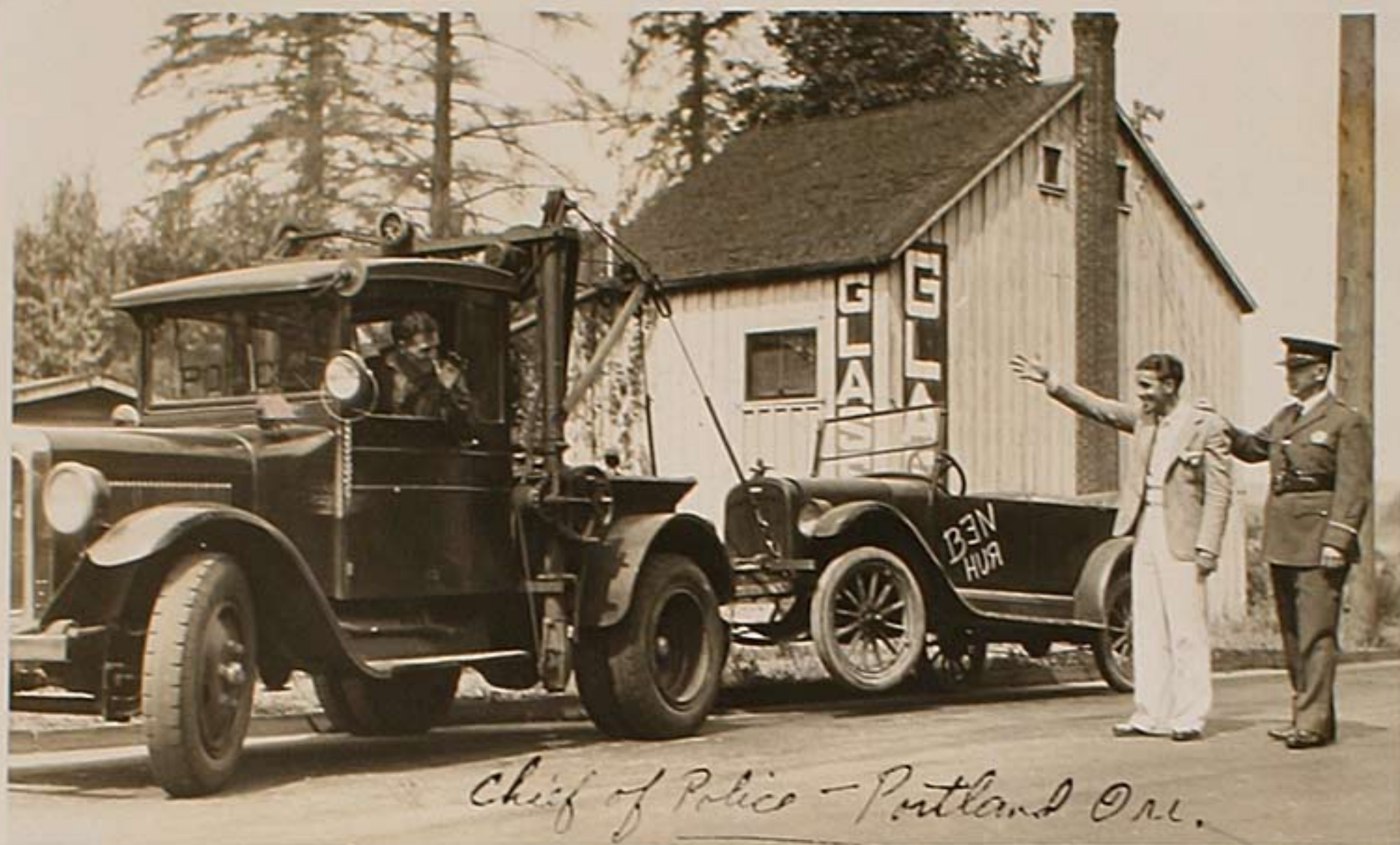
Chief of Police - Portland Ore.