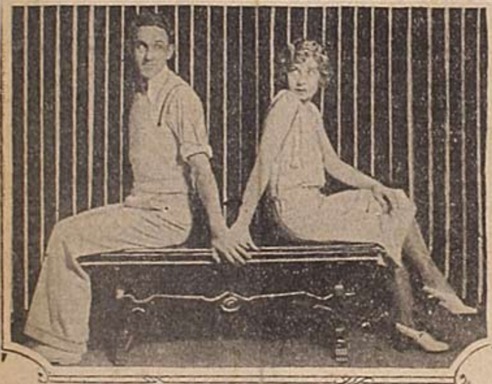
Top—Amos 'n' Andy as they will appear when they are seen as well as heard. Amos (Freeman F. Gosden) is on the left and Andy (Charles J. Correll) on the right. Below—Cecil and Sally, principals in a comic strip of the air heard over KGW six nights a week under the sponsorship of Baybestos.